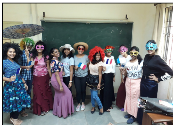
Pic: All set before the event