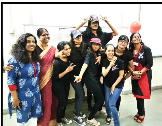
Pic: Group snap, after a job well done

Bastille and the overthrow of monarchy. It is celebrated nationwide through festivities such as parades and parties,